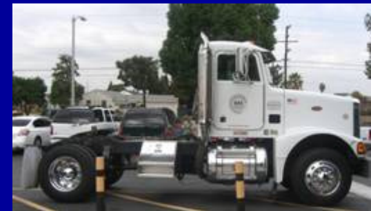
Class 7 & 8