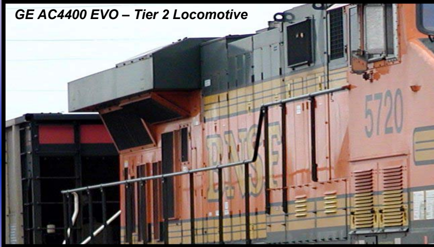
GE AC4400 EVO – Tier 2 Locomotive