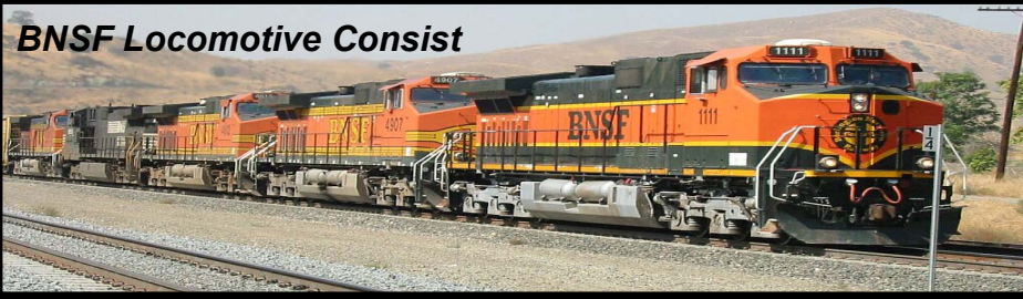
BNSF Locomotive Consist