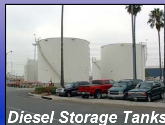
Diesel Storage Tanks