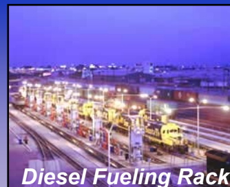
Diesel Fueling Rack