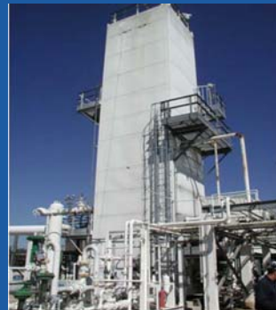
Clean Energy's Pickens LNG Liquefaction Plant