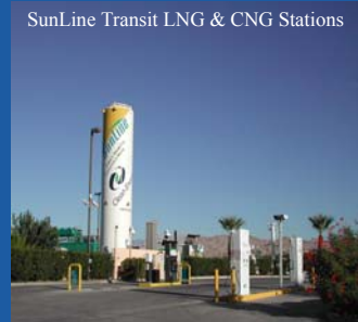
SunLine Transit LNG & CNG Stations